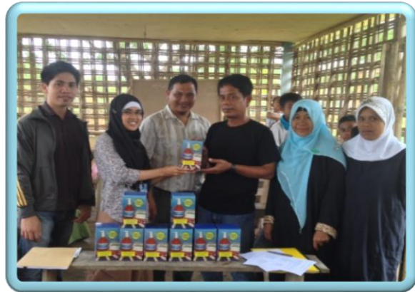
Distribution of EHCP Kits in Madrasatul Huda al-Islamie, Binasing, Pigcawayan, North Cotabato