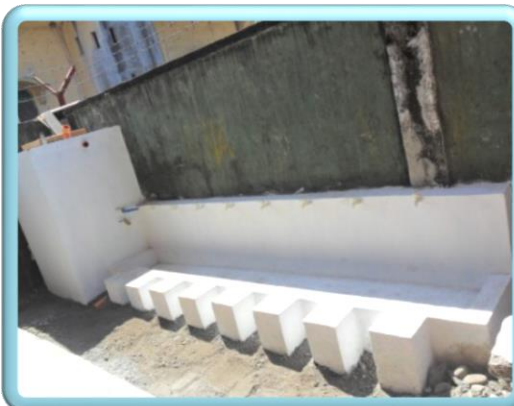
Sample of hand washing facility constructed in Mahad Lanao Al-Islamie Integrated Department, Malabang, Lanao del Sur