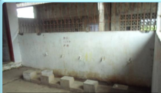
Existing ablution area assessed during ocular inspection in Madrasatul Muallafa Al-Islamiya, Poblacion, Maguing, Lanao del Sur