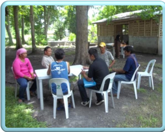
Focus Group Discussion with PTCA Officers during assessment activity in Madrasatul Muslimin al- Guiadid al-Islamiyyah, Barangay Bugawas, Datu Odin Sinsuat, Maguindanao

FGD with PTCA officers and Modarris. This FGD is designed to gather baseline information on the potential support of the parents and modarris for the project and integration of WaSH in the Tahderiyah curriculum. This also assesses initiated activities and practices of the school structure in relation to WaSH in Tahderiyyah. Involving the parents is also needed to sustain the initiative past the direct support stage. The participants are deliberately limited to PTCA officers and/or parents who have 3-5 year old children, and modarris, as part of the Parents-Teachers-Community Association.