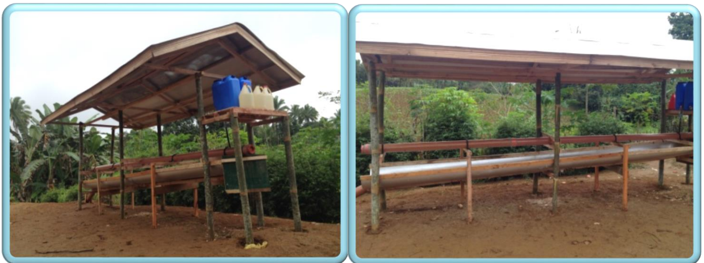
Hand washing station initiated through the resources and efforts of the PTCA Officers in Madrasah An-Nahda Al-Islamie, Pantao Ranao, Pantar, Lanao del Norte