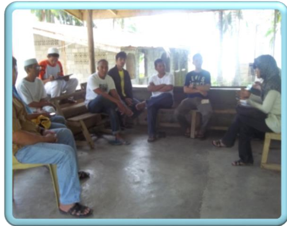
Focus Group Discussion with PTCA Officers and Modarris during assessment activity in Tahderiyyah Sabang Center, Sabang Lucatan, Tarragona, Davao Oriental

FGD with Modeer, political committee members, and BLGU officials. This FGD is designed to assess the extent of support of the entire community for integration of WaSH in Tahderiyyah. The assessment questionnaire for this group primarily seeks to generate information on the level of support of the community, as well as other local mechanisms of support (e.g. BLGUs, POs, parents, etc) that can be tapped to support the supply of soap and toothpaste/brushes and should there be a need to enhance existing or develop new WaSH facilities Tahderiyyah.