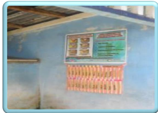
Sample of IEC Materials provided to all madaris