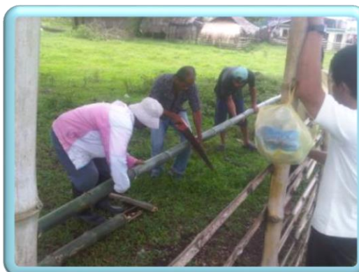
Bayanihan system during construction of hand washing facility in Madrasatul Huda Al-Islamie, Barangay Binasing, Pigcawayan, North Cotabato