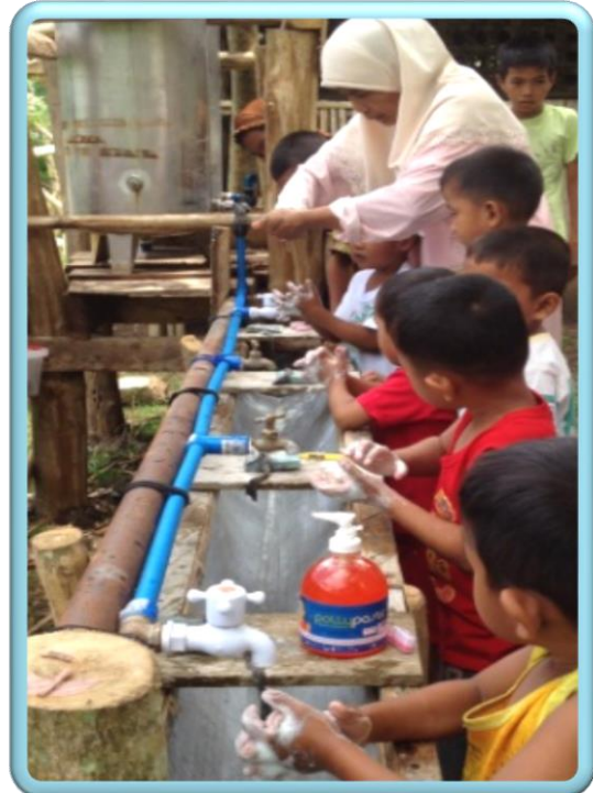
One ustadza in Madrasatul Muslimin al-Guiadid al-Islamiyyah, Bugawas, DOS, Maguindanao demonstrating proper hand washing steps to the pupils during integration of WaSH activities in the madrasah

The focus here is on enabling modarris to become good facilitators themselves of integrating WaSH activities in the Tahderiyyah. In this stage, there is a need to increase the confidence of the Tahderiyyah modarris to teach proper group hand washing and proper group tooth brushing to her/his own pupils (as against the facilitators being seen as the models). The value of return demo by modarris is most crucial. The key personnel from the implementers' team for this activity is/are the facilitators working closely with the Tahderiyyah modarris to empower her/him to impart WaSH knowledge to pupils.