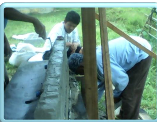
Bayanihan system during construction of hand washing facility in Laak Madrasato Rashidah, Prk. 6-A Muslim Village, Poblacion Laak, Compostela Valley