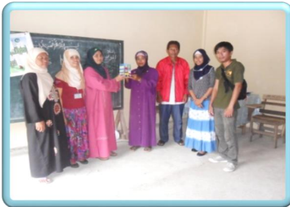
Modarris in Madrasah Darul-Ulom Al-Islamiyyah, Baliango, Palimbang gratefully received the EHCP Kits for their madrasah