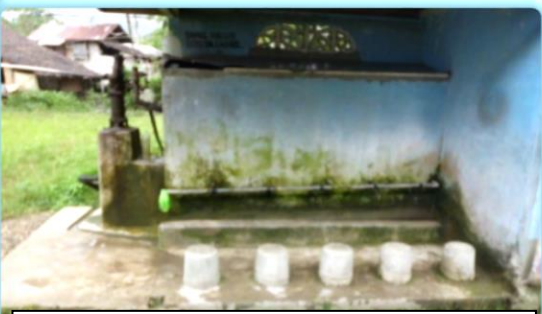
Existing ablution area assessed during ocular inspection in Madrasatul Darrul Arabiyah Al-Islamiyah, San Roque, Palimbang

Ocular inspection. This is an activity led by the technical staff (a WaSH engineer) and necessarily follows after the FGD with Modeer, political committee members, and the BLGU officials. Among the data that will be generated from the ocular inspection are: presence or absence or functionality of WaSH facilities such as toilet, washing areas, and water sources. In conjunction with data generated from the FGD with community leaders, the team should be able to make its own findings on the quality, reliability, affordability, and accessibility of WaSH services and facilities.