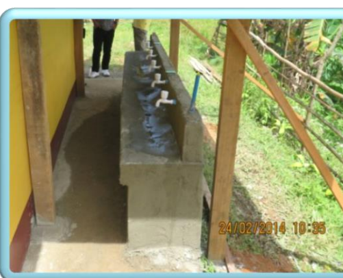
Sample of hand washing facility constructed in Laak Madrasato Rashidah, Prk. 6-A Muslim Village, Poblacion Laak, Compostela Valley